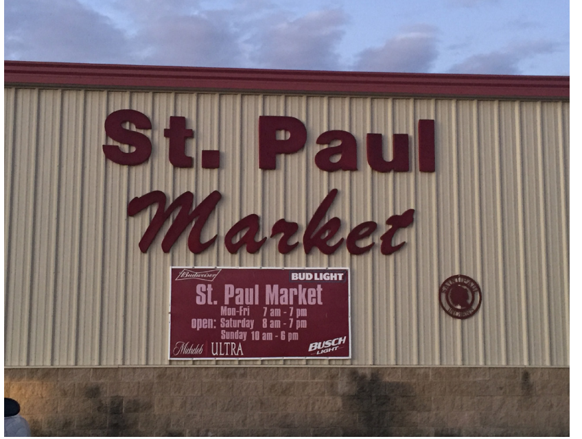
The St. Paul Supermarket sits along highway 47 in St. Paul, Kansas.