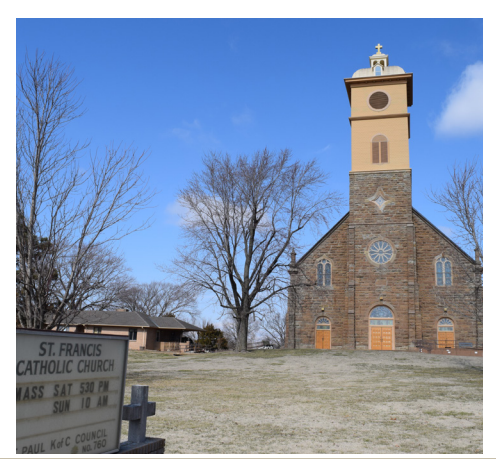
St. Francis Catholic Church is less than one mile away from St. Paul Supermarket.

In rural regions across the country, there are powerful examples of small towns where grocery store are thriving. One of the most important reasons for small town grocery store success is community support. There are a number of ways