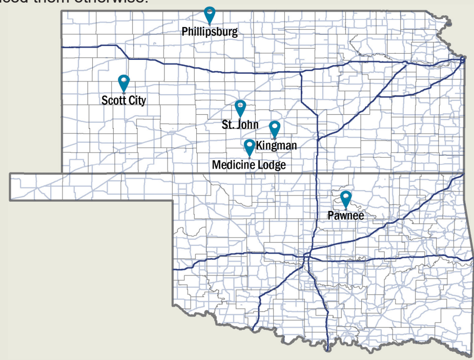
Top Left: The St. John White's Foodliner storefront. Bottom Left: The ribbon cutting at the Grand Opening of White's Foodliner in St. John, Kansas in October 2018. Right: The locations of the six White's Foodliner stores operating in Kansas and Oklahoma.