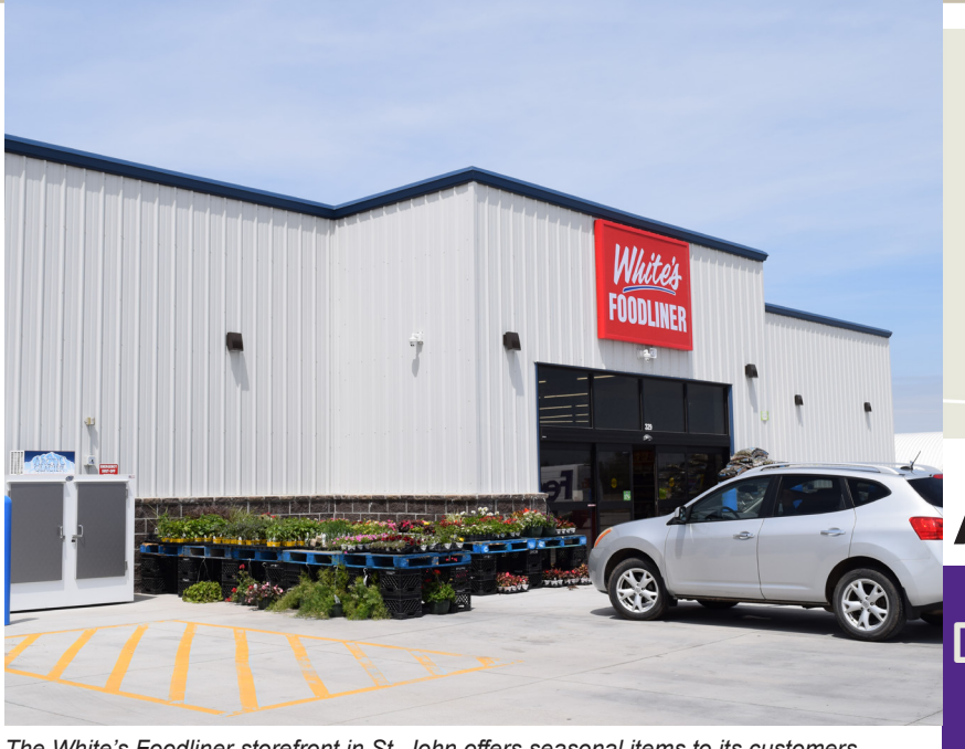
The White's Foodliner storefront in St. John offers seasonal items to its customers.