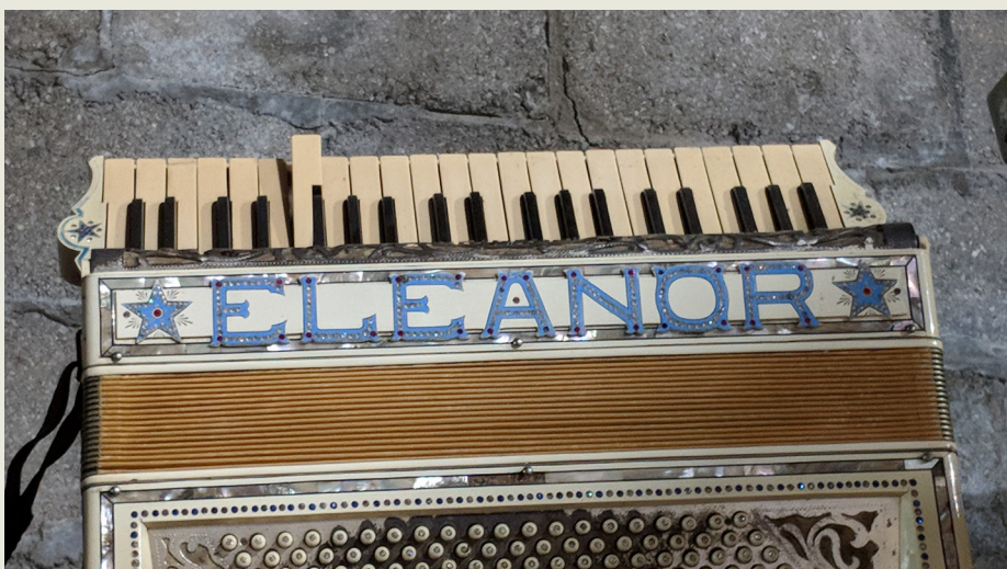
Left, a sign hangs in the Mildred Store announcing monthly music nights every 3rd Saturday of the month. Right, the Eleanor was found in the store amidst 100+ years of accumulation collected by the previous owners.