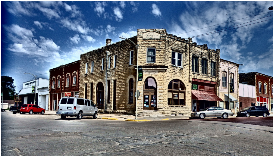
A historic bank building sits in downtown Chapman, Kansas on a sunny day in 2014.