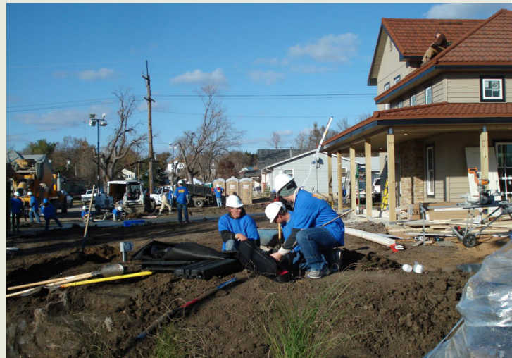
Above left, Chapman residents hug while examining the wreckage from the 2008 tornado. Above right, local volunteers work together during the filming of Extreme Makeover: Home Edition .